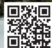
Scan to see more photos and a video tour of this chalet.

Although the house plan had everything the pair needed, they made a few minor adjustments to the design to make it perfect for them. With the help of Normerica’s design team, Hogan and Susan raised the roof pitch, and adjusted the loft position. They also altered the fireplace placement to make it easier to see throughout the main